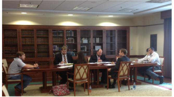
Pictured are competitors from this year's Arbitration Competition.