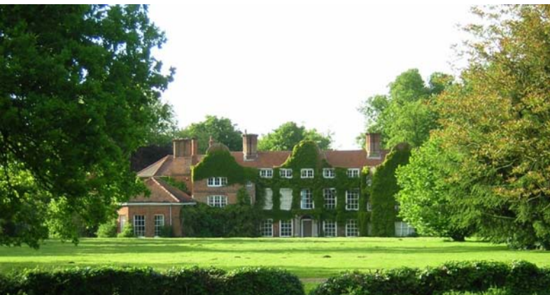
Earham Hall • Norwich Law School

Third year law students have the opportunity to apply for tuition scholarships to obtain a graduate law degree at The Norwich Law School, University of East Anglia, Norwich, England.