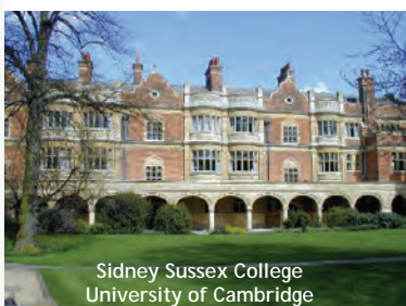
Sidney Sussex College University of Cambridge