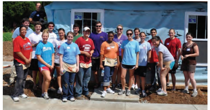
Public Service Day • August 20, 2010