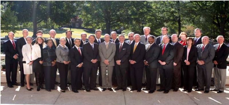
CUMBERLAND SCHOOL OF LAW'S ADVISORY BOARD

The law firms of Starnes & Atchison, White Arnold & Dowd, and Lightfoot Franklin & White are generously hosting lunch for Cumberland students, faculty and the Cumberland Advisory Board members this Friday, March 26 at 11:45 AM on Brewer Plaza (around the fountain).