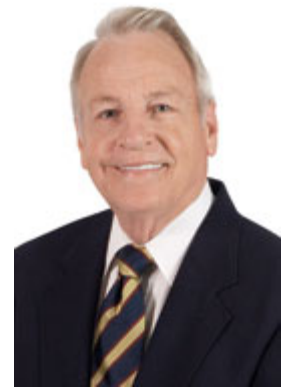
GOVERNOR ALBERT BREWER

The event will be held in the Great Room beginning at noon and will end at 1:00 PM. Lunch will be served.