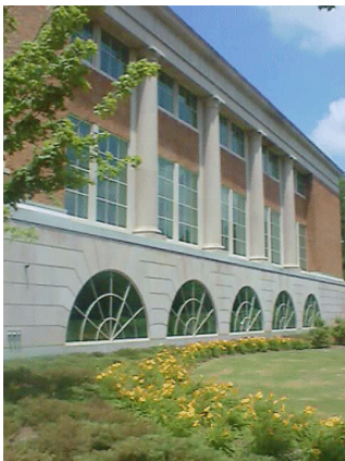
BEESON LAW LIBRARY