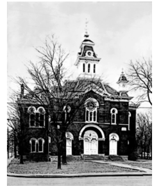
CARUTHERS HALL CUMBERLAND UNIVERSITY SCHOOL OF LAW LEBANON, TENNESSEE