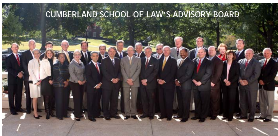
CUMBERLAND SCHOOL OF LAW'S ADVISORY BOARD

Cumberland's Advisory Board has graciously invited law students to this luncheon to meet and socialize with the members and ask questions. Bring your résumé! What a fantastic opportunity to meet these incredibly generous and smart lawyers (alumni) who provide us so much support!