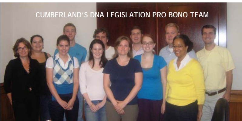
CUMBERLAND'S DNA LEGISLATION PRO BONO TEAM