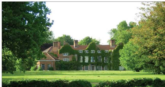
EARLHAM HALL • NORWICH LAW SCHOOL

The LL.M. in international commercial and business law is taught in Earlham Hall, Norwich Law School.