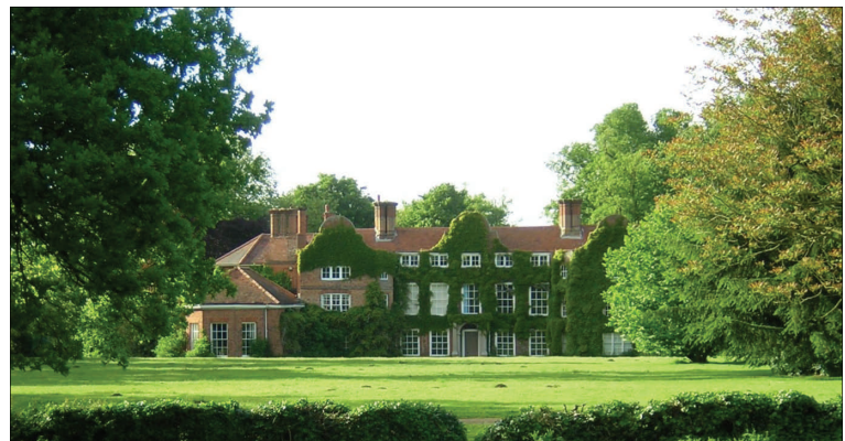
EARLHAM HALL • NORWICH LAW SCHOOL

The LL.M. in international commercial and business law is taught in Earlham Hall, Norwich Law School.