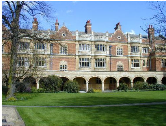
Sidney Sussex College University of Cambridge