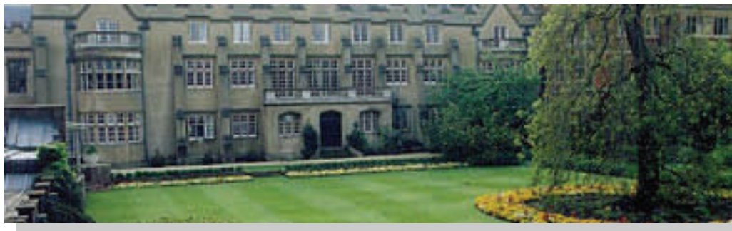
Sidney Sussex College University of Cambridge

An informational meeting concerning Cumberland's 2009 study-abroad program in Cambridge, England will be held Thursday, November 6 , at 11:00 AM in room 123 in Robinson Hall.